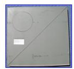
Sample3 Pre Test Impact Side