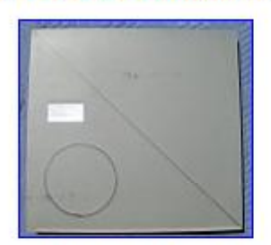
Sample3 Pre Test Read Side